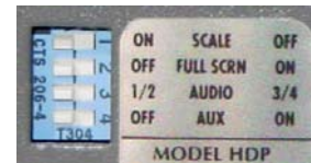
HDP DIP Switches

The exact function of each DIP switch and what it controls is described on the following pages.